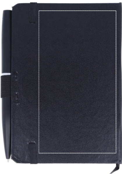
5. BACK SCREEN