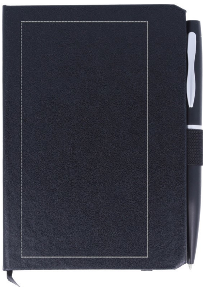
2. FRONT SCREEN