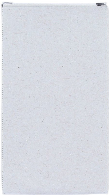
2. FRONT PD