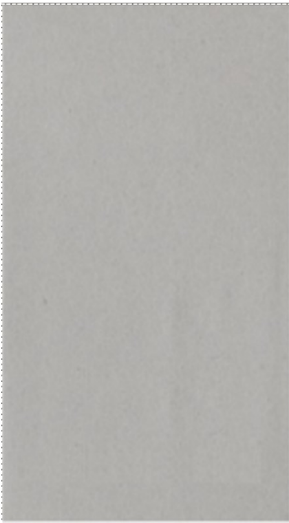
4. BACK PD